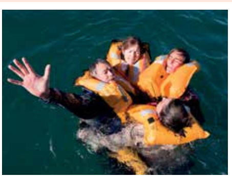
Form a huddle to stay together and minimise loss of body heat

The loss of core body temperature in vital organs such as the heart, lungs and kidneys can cause death quickly. The risk is increased if the person is anxious, hungry, exhausted or mentally low.